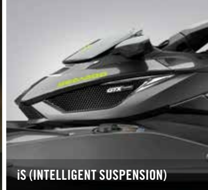
iS (INTELLIGENT SUSPENSION)