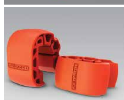
SNAP-IN FENDERS (OPTION)

Tailor your ride just the way you want it to go longer in all conditions with our industry-exclusive intelligent suspension and a more powerful engine for stable and predictable performance aboard the luxurious GTX Limited iS 260. On this watercraft, luxury and convenience come standard for the ultimate on-water experience.