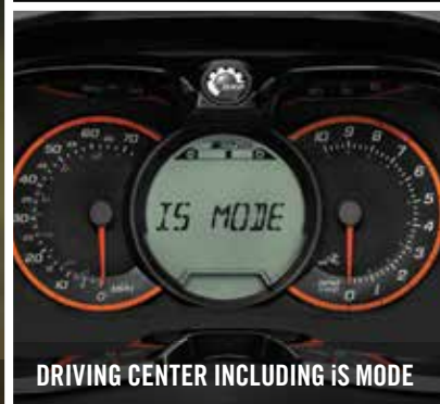
DRIVING CENTER INCLUDING iS MODE