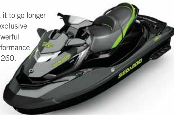
NEW Anthracite Grey & Manta Green ●

Tailor your ride just the way you want it to go longer in all conditions with our industry-exclusive intelligent suspension and a more powerful engine for stable and predictable performance aboard the luxurious GTX Limited iS 260. On this watercraft, luxury and convenience come standard for the ultimate on-water experience.